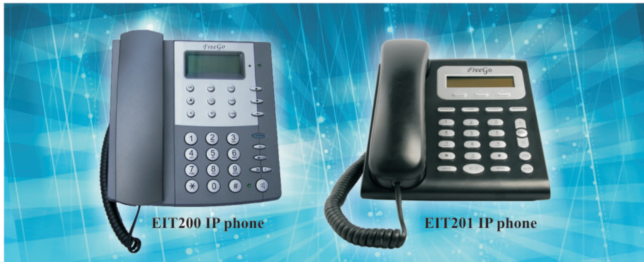
EIT200 IP phone